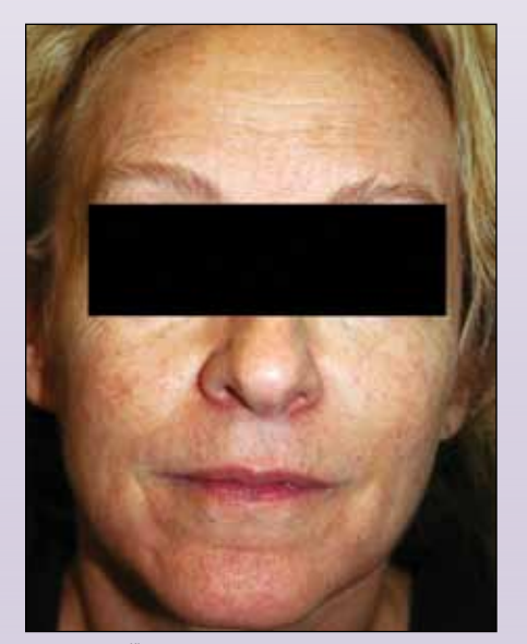
After six Accent<sup>XL</sup> treatments