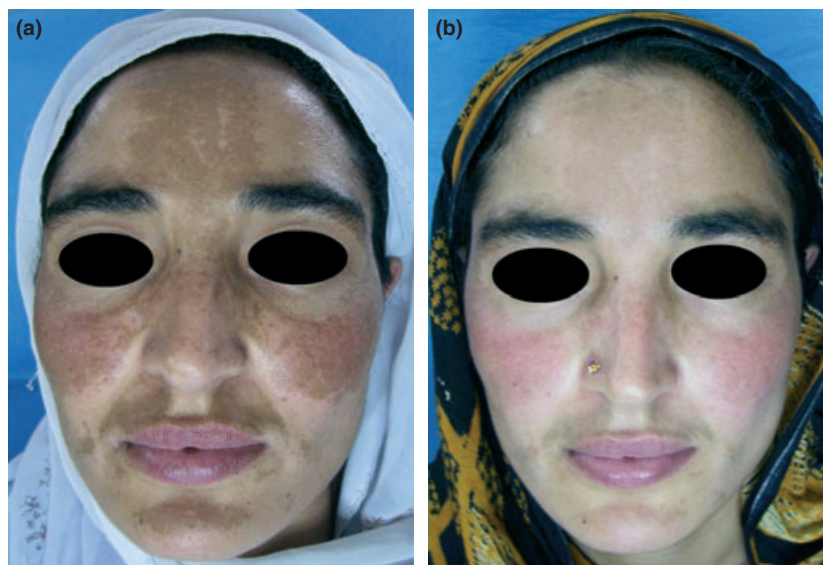
Figure 3 Pretreatment (a) and post-treatment (b) result in mixed-type melasma. Rated score 4 by patient herself

different available modalities such as bleaching creams, chemical skin peeling, microdermabrasion, IPL, and QS Nd:YAG laser. The patients had not shown any appreciable improvement to treatments offered to them for at least six months; therefore, for the purpose of this study we treated them as one group of refractory melasma. Although epidermal melasma responds better to standard melasma therapy, the success rate could be quite variable. Some patients with melasma have hyperactive melanocytes, and topical agents may have limitations in inhibiting the melanogenesis in them. Moreover, a poor