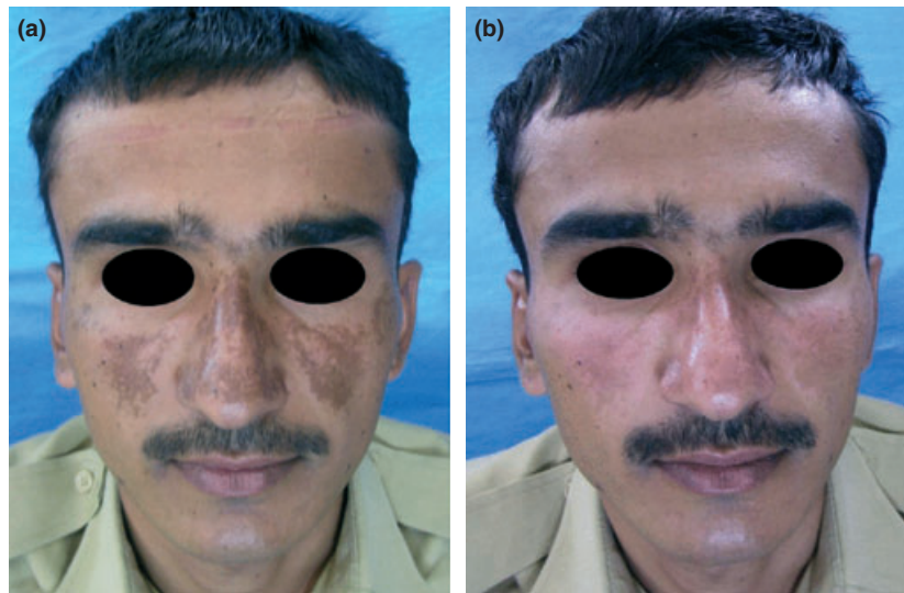
Figure 2 Pretreatment (a) and post-treatment (b) result in mixed-type melasma. Rated score 4 by an independent observer